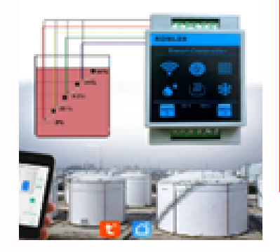
Liquid/Water/Petrol/diesel/Fuel Level Cont

Door and window sensors are key components of any home security system. They detect unauthorized entry or attempted break-ins by alerting homeowners when doors or windows are opened or closed.